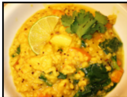
Simple kitchari with vegetables, garnished with lime and cilantro.