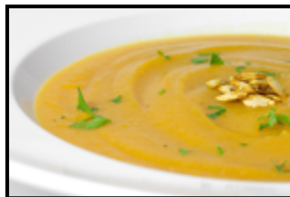
Make a creamy butternut squash soup for grounding and calming.