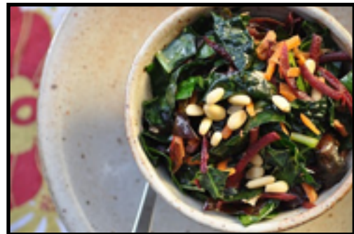
marinated chard, shredded carrot, soaked almonds and shredded beets

avocado grated beets grated carrots parsley, sage, rosemary or thyme. Or cilantro, dill, lemon balm! pine nuts sunflower seeds pumpkin seeds raw dried or fresh berries